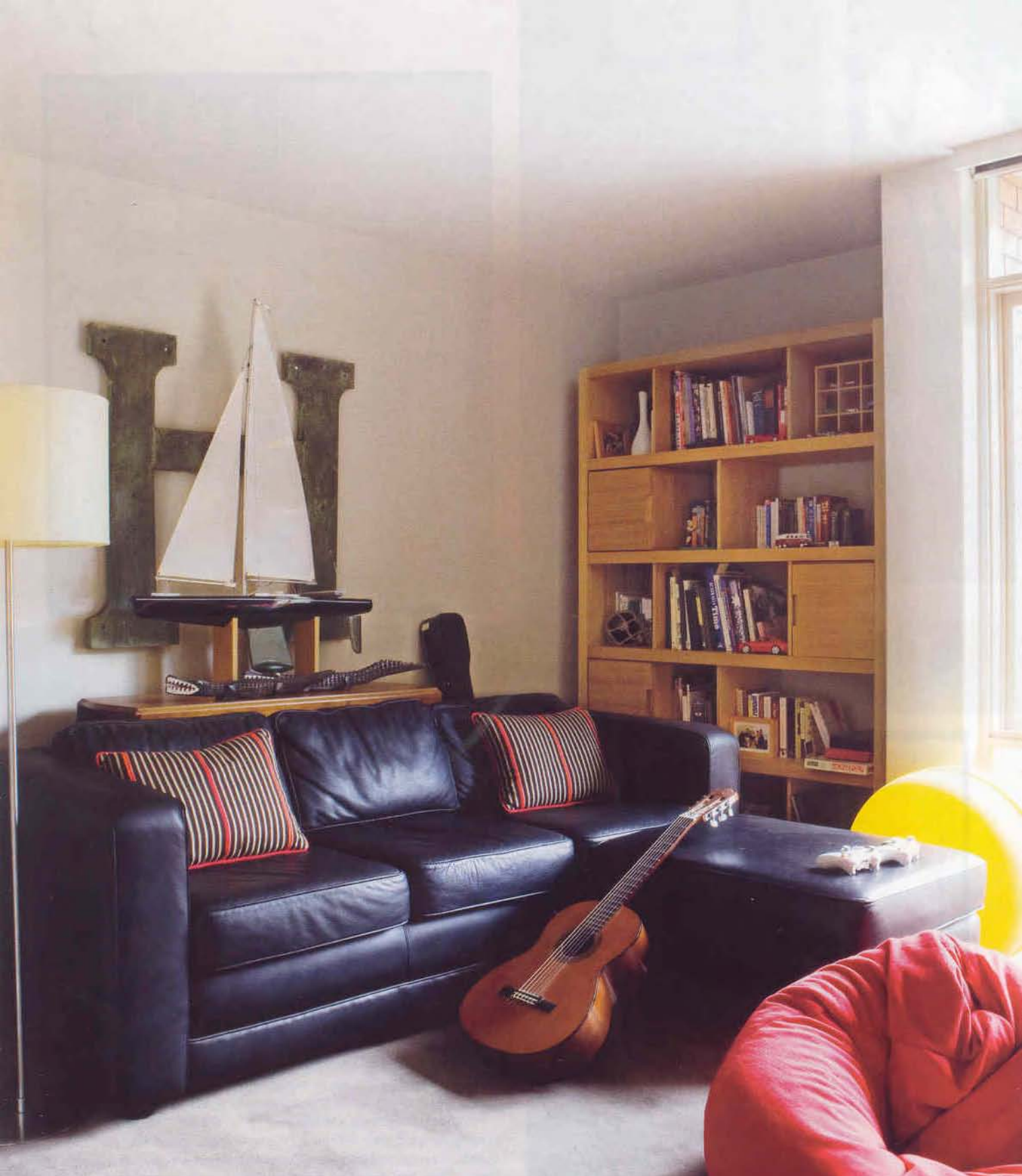
Fiona's teenage sons (opposite) Nick (left), 14, and Tim, 18, are free to spread out in their own rumpus room (this page). A custom-made sofa bed comes in handy when friends stay over, while a beanbag from Freedom is the perfect spot to relax. The boys' books and bits and pieces are tucked away in solid shelves from Temperature Design. >